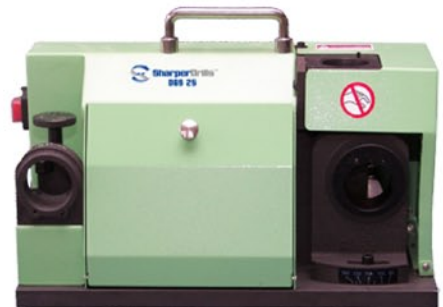
Photo: DGS 25

A CBN grinding wheel is included and easily exchanged with the optional diamond plated grinding wheel.