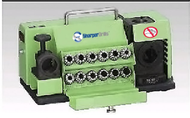
Integrated Collet Stock Shelf

For best drill concentricity, the perfect point is guaranteed by the collet clamps. Conveniently stored in the front rack of the grinder, collet sizes from #8 to #22 in 0.040" (1mm) steps are readily available. For the DGS 25 sharpener additional collets to support up to 1" drill diameters plus a grinding chuck adapter with collets from #3 to #7 are supplied for drill bit diameters from 3mm (2/32") to 7mm (0.32") in size.