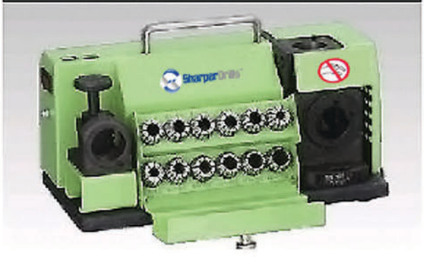
Integrated Collet Stock Shelf

For best drill concentricity, the perfect point is guaranteed by the collet clamps. Conveniently stored in the front rack of the grinder, collet sizes from #8 to #22 in 0.040" (1mm) steps are readily available. For the DGS 25 sharpener additional collets to support up to 1" drill diameters plus a grinding chuck adapter with collets from #3 to #7 are supplied for drill bit diameters from 3mm (2/32") to 7mm (0.32") in size.