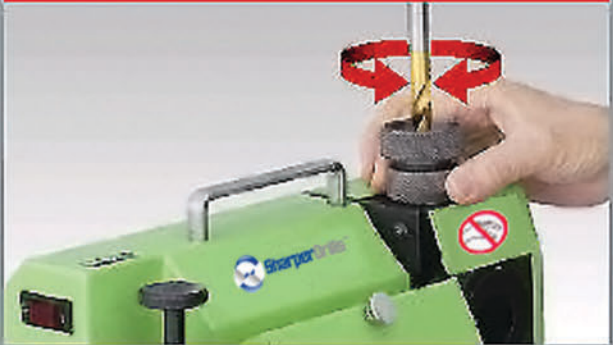
Second: Grinding The Relief (Web Thinning)