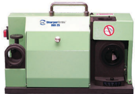
Photo: DGS 25

A CBN grinding wheel is included and easily exchanged with the optional diamond plated grinding wheel.