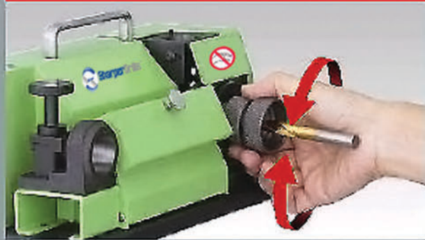
First: Grinding The Drill Point In One Step