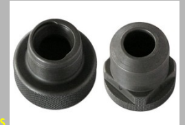
Three Flute End Mill Tools Chuck Set & Adapter Bushings