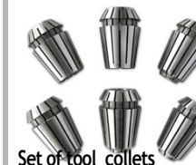
Set of tool collets