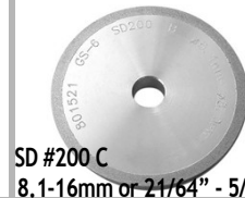
SD #200 C 8.1-16mm or 21/64"-5/8"