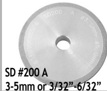
SD #200 A 3-5mm or 3/32"-6/32"