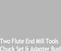
Two Flute End Mill Tools Chuck Set & Adapter Bushing