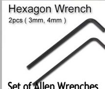
Hexagon Wrench 2pcs ( 3mm, 4mm )