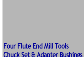
Four Flute End Mill Tools Chuck Set & Adapter Bushings