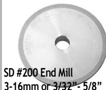
SD #200 End Mill 3-16mm or 3/32"-5/8"