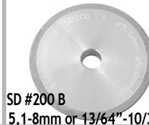
SD #200 B 5.1-8mm or 13/64"-10/32"