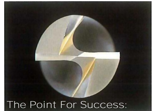
The Point For Success:

Benefits from using NACHI SG-ESS stub length drills, are starting with the drill point. The point to your success with high performance. To keep this point sharp, our SharperDrills™ DGS-18 drill sharpener equips you with the quality to "do it yourself" sharpening. The DGS-18 point is hi-performance with simplicity, and a professional, reliable, all metal design. Profitable, precise, straightforward sharpening, easy to use for everyone.